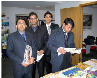
Students from India at the EIUC stand

As in recent years, the call for applications for the E.MA academic year 2008/2009 was supported by the presence of an EIUC stand at the InfEuropa of the European Commission and the Council of the European Union in Brussels. From January until March 2008, visitors (mainly trainees and officials of the European institutions, but also groups of students from many countries) had at their disposal advertising materials for the E.MA Programme and a sample of the latest EIUC publications.